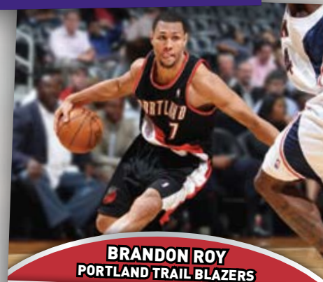
BRANDON ROY PORTLAND TRAIL BLAZERS