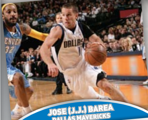
JOSE (J.J.) BAREA DALLAS MAVERICKS