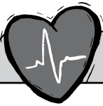
Heart Rate Data Table

Instructions: Perform each activity for 30 seconds, 1 minute, and 3 minutes. After each time period, take your pulse and record that number in the chart below. Then, answer the questions.